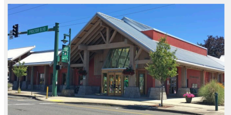
Sandy Public Library (1 gallery) 38980 Proctor Blvd. Sandy