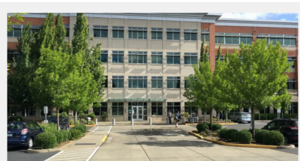
Clk Cty- Public Services Building (3 galleries) 2051 Kaen Rd. Oregon City