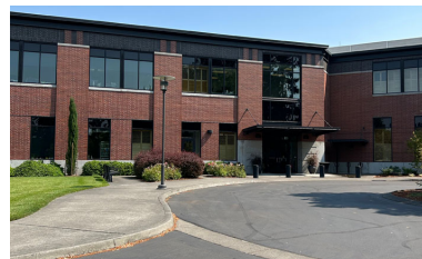
Wilsonville City Hall (1 gallery) 29799 SW Town Center Loop E. Wilsonville