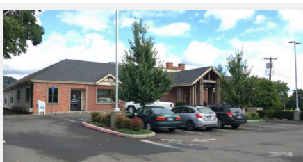
City Hall of Oregon City (1 gallery) 625 Center St. Oregon City