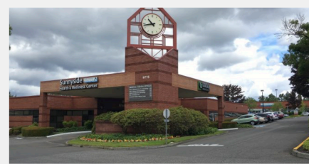
Sunnyside Health Center (1 gallery) 9775 SE Sunnyside Rd. #200. Clackamas