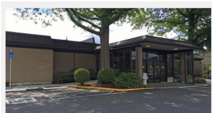
Providence Milwaukie Hospital (1 gallery) 10150 SE 32 Ave. West Entrance. Milwaukie