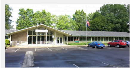
Beavercreek Health Center (1 gallery) 110 Beavercreek Rd. Oregon City