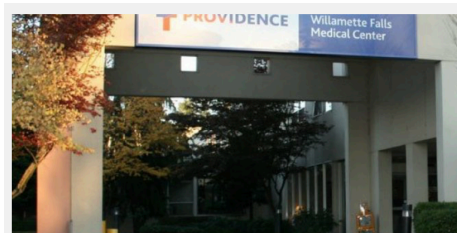
Providence Willamette Falls Medical Center (2 galleries) 1500 Division St. Main Entrance. Oregon City