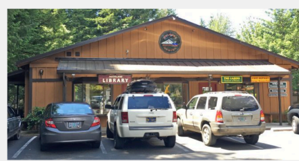
Hoodland Library (1 gallery) 24525 E Welches Rd. Welches