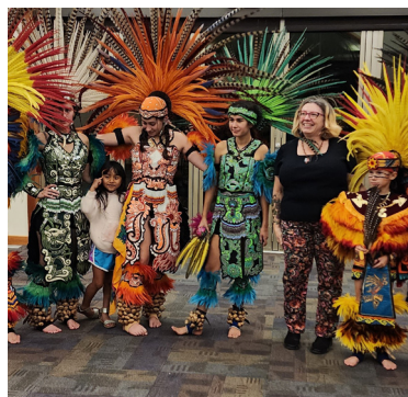
Danza Azteca 2023

awarded to non-profits via Clackamas County Cultural Coalition grants in 2023!